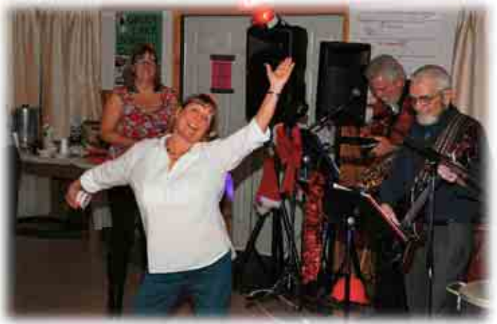
Christmas Party Photos - continued .....