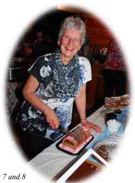
More pictures on pages 7 and 8